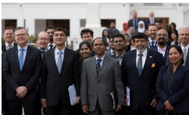
Top image: Australia Awards scholars arrive at the Scholars Forum.